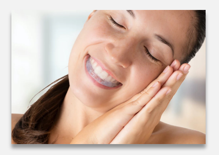
Gum shield for tooth grinding