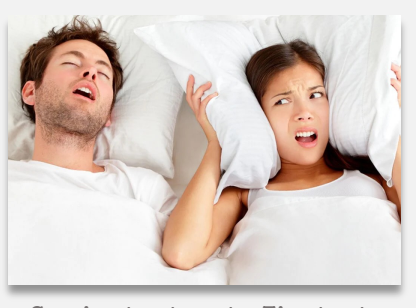
Snoring treatments: Tips to stop snoring and to know when to consult