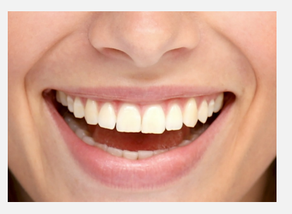
How to treat bruxism?