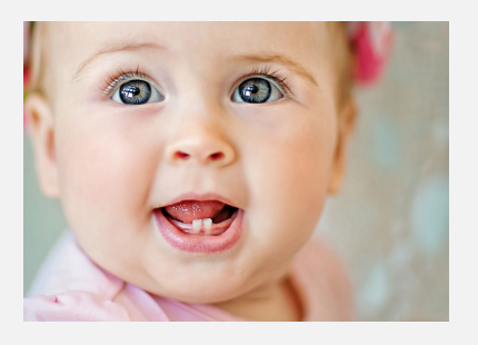
Baby teeth: dental heath and your child's teeth