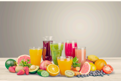
EIGH RECIPES OF HEALTHY JUICES TO BOOST YOUR MOOD