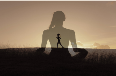
12 FULL BODY WALKING BENEFITS