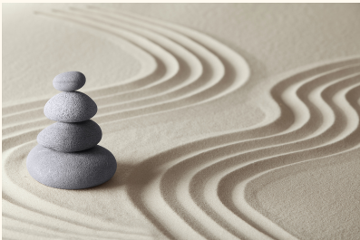
THE BENEFITS OF MEDITATION